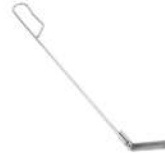
Ash tool - Ref CQ