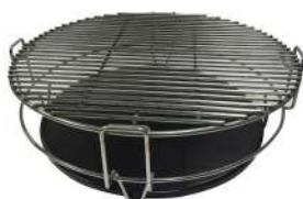
Split & Mix - Ref SMQM