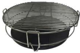
Split & Mix - Ref SMQL