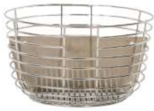
Charcoal basket - Ref CBQL