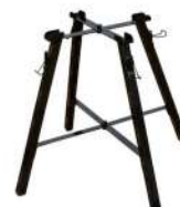
High Stand - Ref HSQM