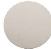
Pizza stone - Ref PSQL