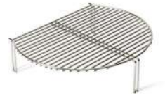
Extension - Ref EXTGQL