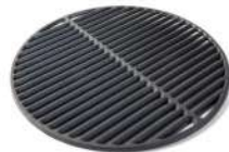
Grille fonte circulaire - Ref CIM