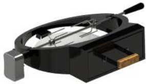
Rotisserie pizza oven - Ref RPQL