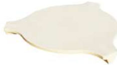
Deflector - Ref DQL