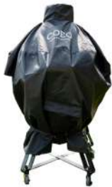
Cover - Ref HPQUATROL